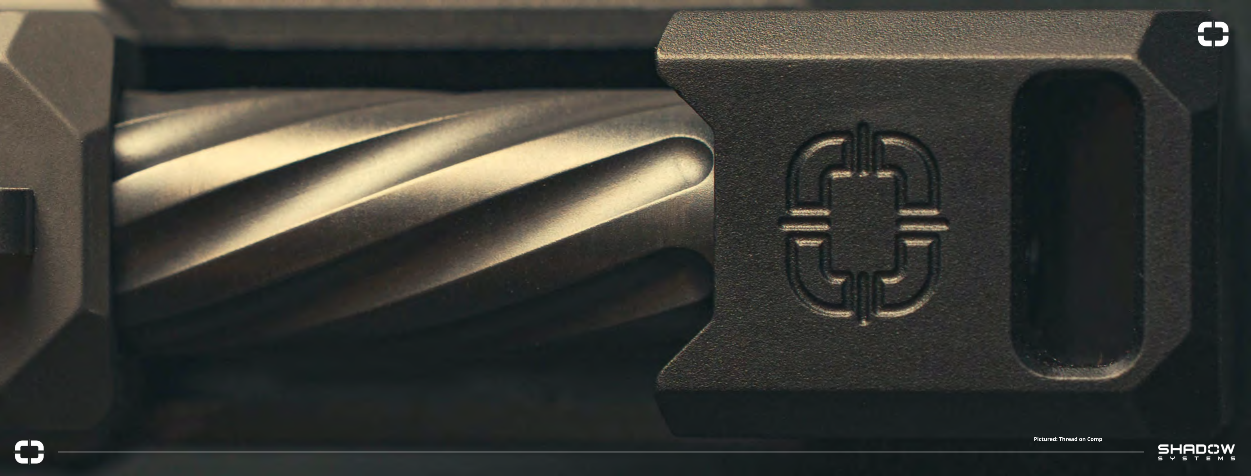
Pictured: Thread on Comp