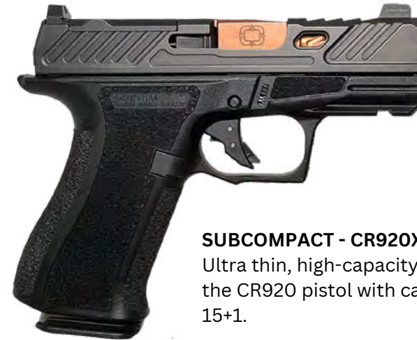
SUBCOMPACT - CR920X Ultra thin, high-capacity version of the CR920 pistol with capacity of 15+1.