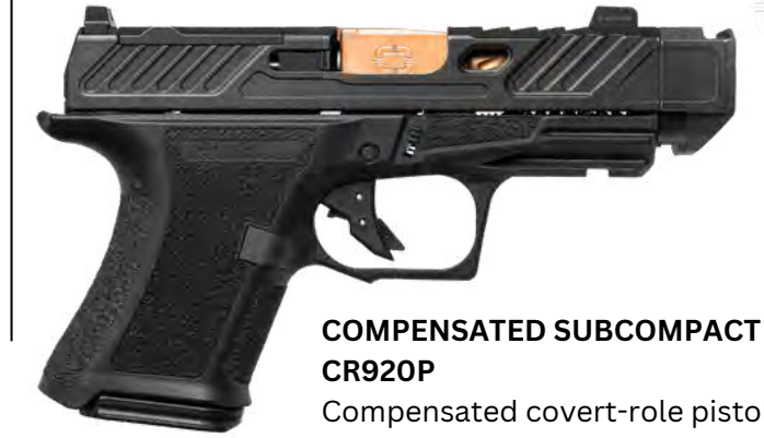
COMPENSATED SUBCOMPACT - CR920P Compensated covert-role pistol that shoots like a full size.