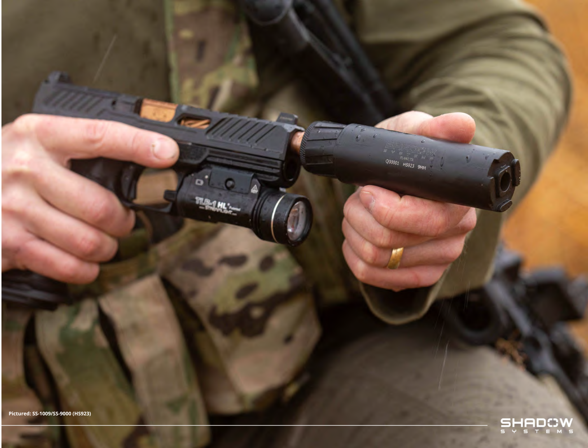
Pictured: SS-1009/SS-9000 (HS923)

The HS923 Front Cap allows for the slide of any MR, DR, XR, or CR handgun to be used as a wrench to install or remove the cap from the suppressor