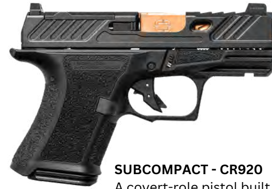
SUBCOMPACT - CR920 A covert-role pistol built for deep concealment with capacity of 13+1.